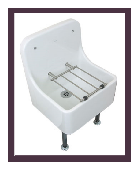
High back cleaner's sink

easy clean stain-resistant glazed surface designed to withstand heavy use